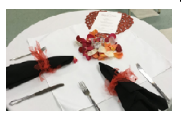
Table for Two, You are my Valentine

Again, due to COVID we have been sidelined. Therefore, for those in Edmonton and area (Sherwood Park, Leduc, Beaumont, St. Albert) we are providing the opportunity to order a sumptuous meal for two created by a red seal chef, which will be delivered right to your home! All you have to do is set the table, light the candles and follow the instructions to heat your meal.