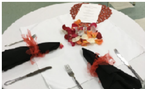
Table for Two, You are my Valentine

Again, due to COVID we have been sidelined. Therefore, for those in Edmonton and area (Sherwood Park, Leduc, Beaumont, St. Albert) we are providing the opportunity to order a sumptuous meal for two created by a red seal chef, which will be delivered right to your home! All you have to do is set the table, light the candles and follow the instructions to heat your meal.