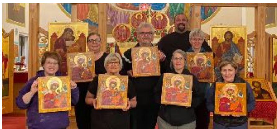
Group Photo of this past weekend's Icon Workshop