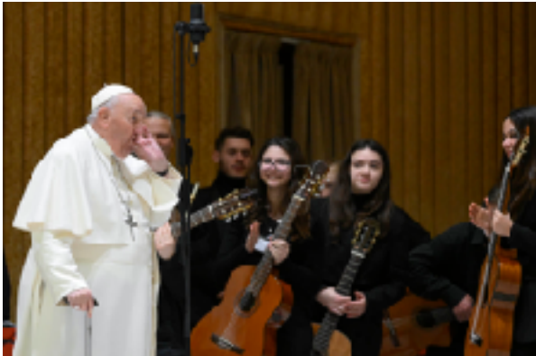
Pope Francis greets members of a youth orchestra from Carpi, Italy, before his weekly general audience in the Vatican audience hall Feb. 15, 2023.